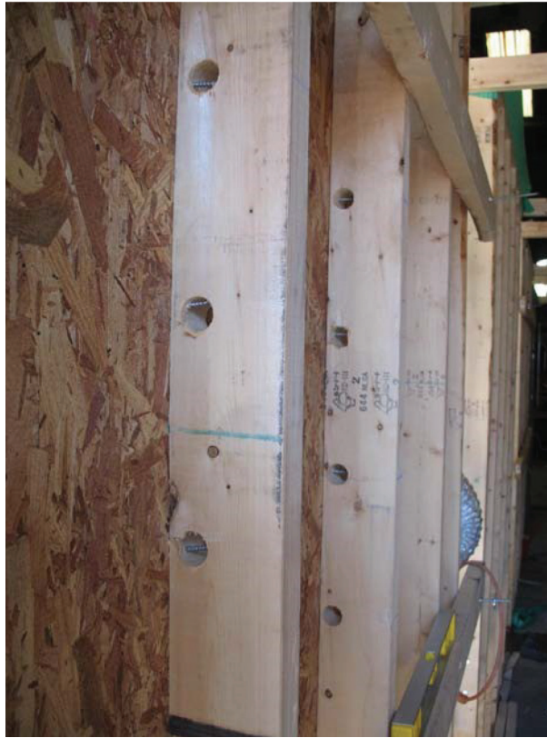
Figure 2 Observation holes at anchoring screws in wood studs.

The test walls were constructed with a trough below the test area to collect water. (See Figure 1) The procedure called for measuring the water that was collected in the trough, measuring any water that might penetrate into the drainage wrap and drain to the bottom of the test panel, and observing any wetness behind the sheathing with emphasis on monitoring the screw penetrations.