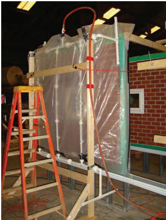
Figure 3 E1105 Setup

Type 2: Tru-Brix siding installed over \frac{5}{8} " Fiberglass faced exterior gypsum sheathing (Georgia Pacific Dens-Glass Gold) on 18 gauge steel studs spaced at 16" on center. A non-flanged 16" x 16" window was installed with standard construction methods. The E1109 spray test apparatus was set up the same way as for Type 1.