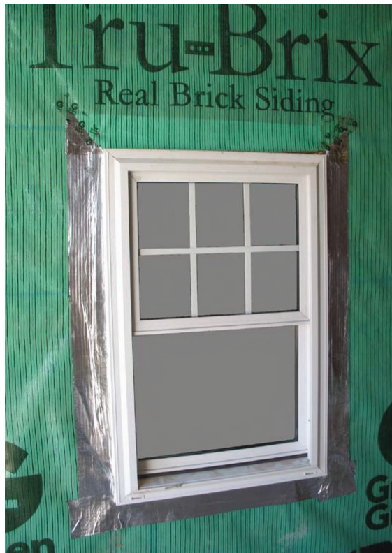
Figure 5 Window with Drainage Wrap and Flashing.

Test Method: Examinations of the results show that correct window flashing details are required to prevent water penetration at window heads. The correct installation is shown in Figure 5. The Drainage Wrap must be cut to install window head flashing underneath the Wrap. Any moisture in the Drainage Wrap will then be removed from the wall by the window head flashing.